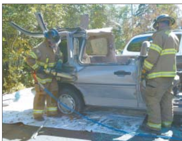
Gazette Amy Allan

The open house also was the department's kick-off of